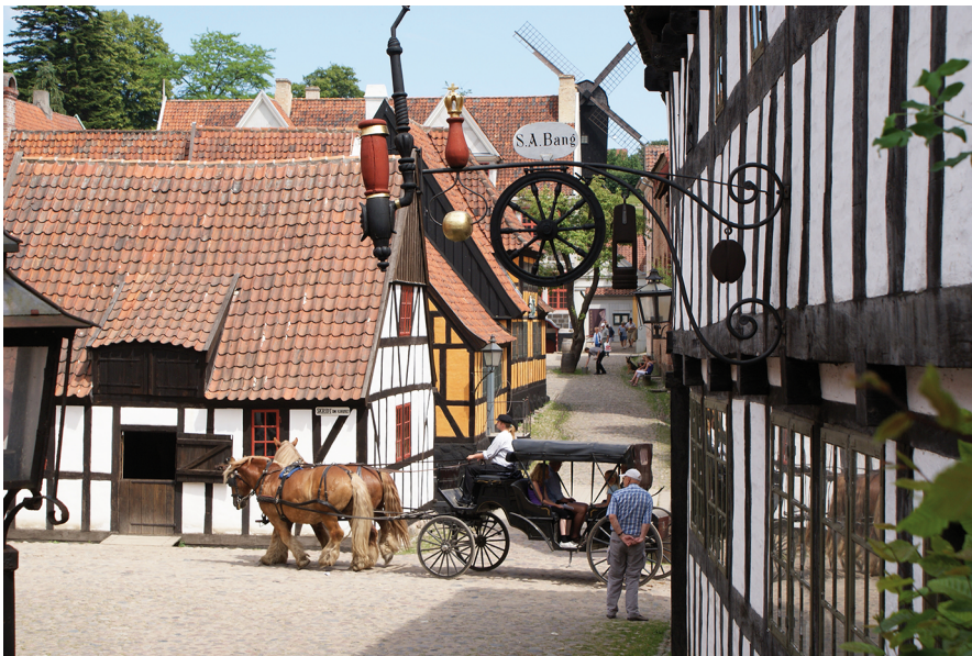
Den Gamle By "The Old Town" Open-Air museum.