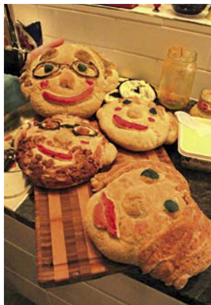
The team in charge.

I could go as so far to say that this is my perfect training ground. Top quality facilities, the best doctors, and a supportive student community. Where competition and personal success is second to a collaborative performance. Where everyone is talented, and there is no lack of motivation as the passion for medicine still burns. Okay, fine, I admit it; I'm a geek and get excited by this.