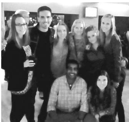
The eight exchange students.

The focus is more on the clinical, practical aspects, achieved by working in a safe, controlled environment. Its ideal, everything is interactive. Situations which promotes developing the relevant skills and cements understanding. Students learn from each other, and from their supervisors, ensuring reciprocal benefit.